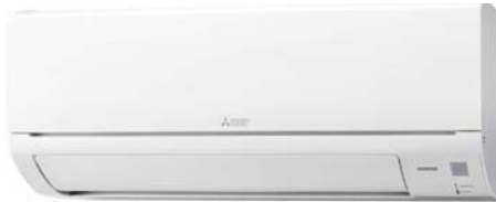
Indoor Unit: MSZ-GL18NA-U1