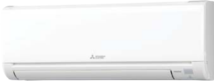
Indoor Unit: MSZ-GL15NA-U1